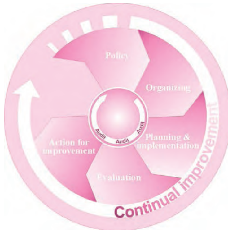
Figure 2. Main elements of the OSH management system

Occupational safety and health, including compliance with the OSH requirements pursuant to national laws and regulations, are the responsibility and duty of the employer. The employer should show strong leadership and commitment to OSH activities in the organization , and make appropriate arrangements for the establishment of an OSH management system. The system should contain the main elements of policy, organizing, planning and implementation, evaluation and action for improvement, as shown in figure 2.